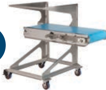
Side boards removed