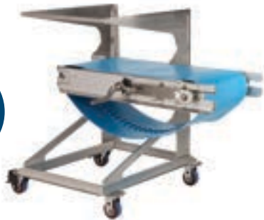
Belt tensioner dis-engaged