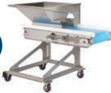
Infeed belt system with hopper